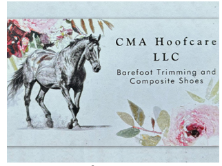
$120 CMA Hoofcare LLC Cameryn Allen