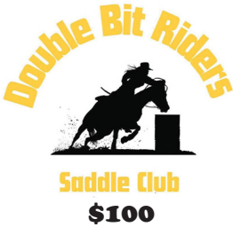
$100 Double Bit Saddle Club