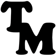
$100 Theresa Meyer