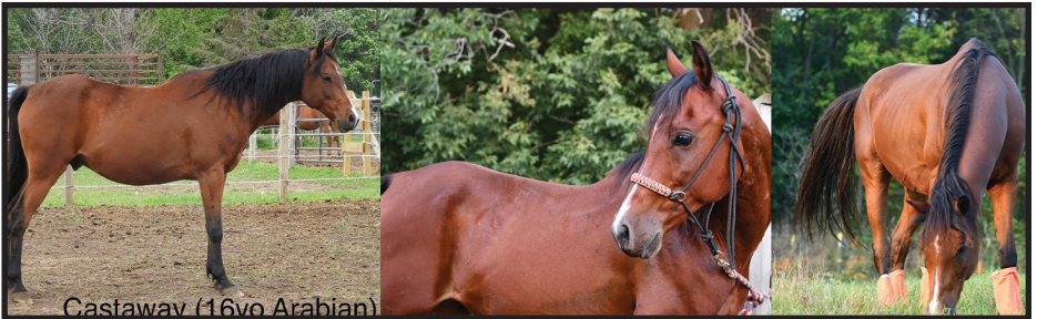
Castaway (16yo Arabian)