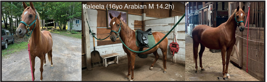
Kaleela (16yo Arabian M 14.2h)