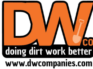
$100 DW Companies LLC