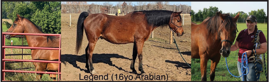
Legend (16yo Arabian)

I am excited about this trainers competition to show that every horse needs a chance.